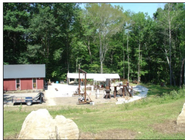
Red Barn Foundry at Sculpture Trails